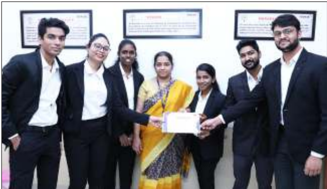
DATA VISUALIZATION WORKSHOP