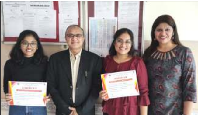
GOOD & SERVICE TAX (GST) CERTIFICATION