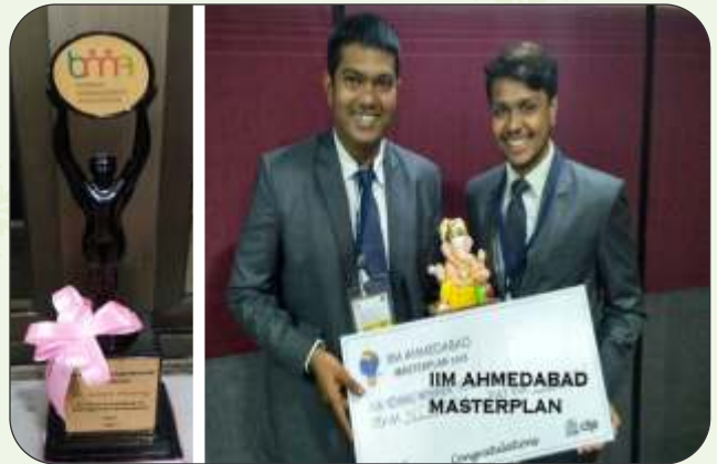
STUDENTS ACHIEVEMENTS AND AWARDS