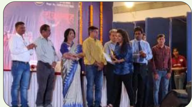
At KES SHROFF