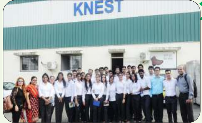
Domestic Industrial Visit - Pune & Mahabaleshwar, PGDM 2019