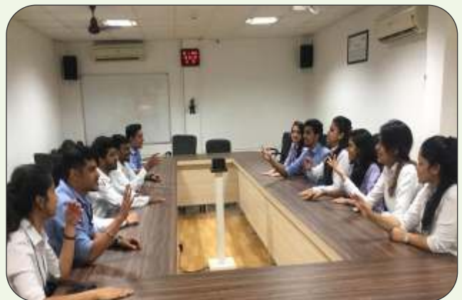
PEER TO PEER LEARNING