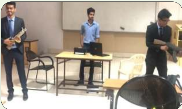
Students Role Play based on Case Studies

SFIMAR insists role play activities in class room setting. Role-play is any activity when you either put yourself into somebody else's shoes, or when you stay in your own shoes but put yourself into an imaginary situation and play.