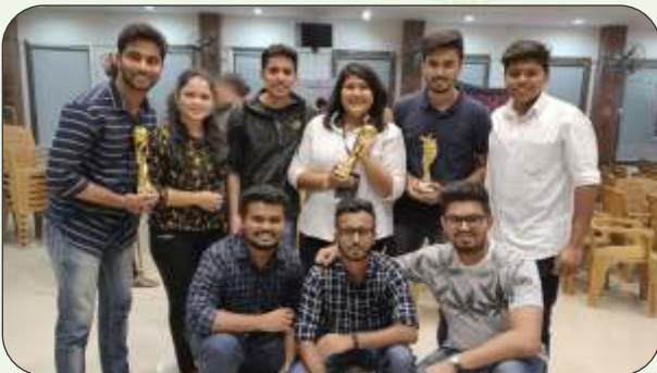
At KES SHROFF