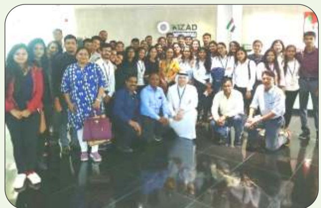
International Industrial Visit 2018