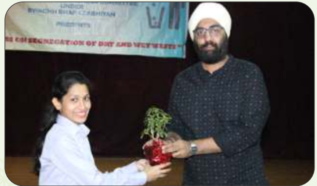
Awareness talk on waste management