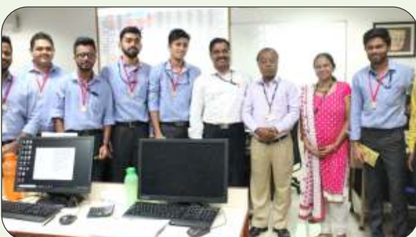
MOCK STOCK 1st Prize Winner