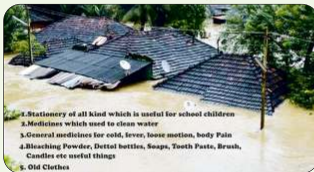
SFIMAR DLLE Team to Resettle flooded Kolhapur in association with Sakal Maratha Samaj, Vasai by donating all kind of stationer, clothes and medicines.