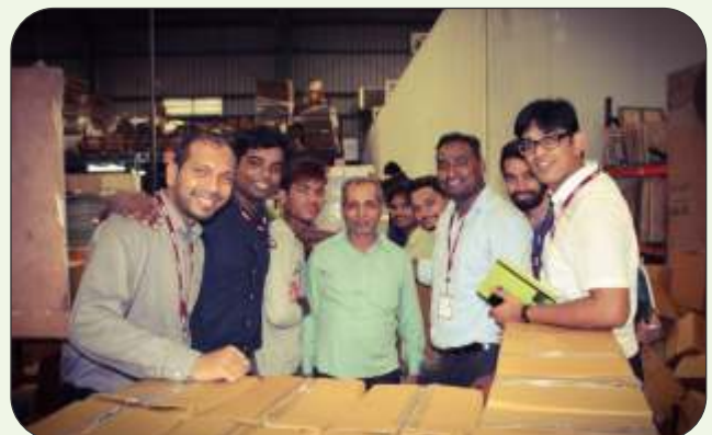
Part Time Students Industrial Visit Igatpuri - 2019