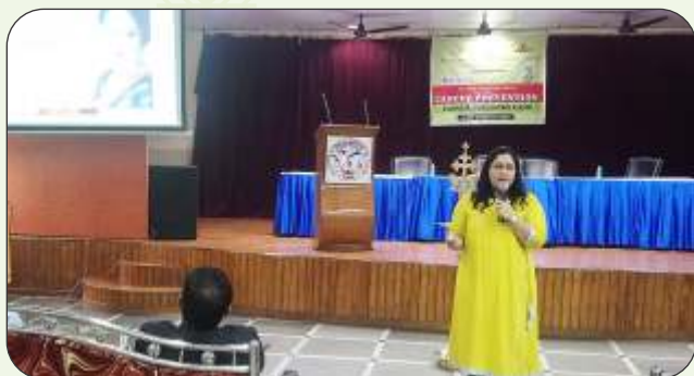
SFIMAR - DLLE, Health Talk on CANCER and CANCER Screening Camp on 12th October, 2019 in association with HCG CANCER CARE