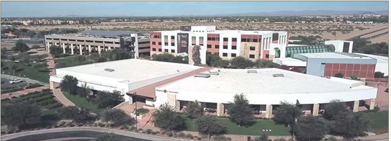
OTTAWA UNIVERSITY USA

This MOU was executed on 07th of October 2018 between Ottawa University and SFIMAR to establish and develop bi-lateral relationships between the institutions so to enhance research and educational processes at both institutions and thereby expand the academic spectrum and their culture awareness between faculty, staff and students. This MOU will facilitate exchange of faculty members, students and academic information, materials, programs, in developing and implementing joint academic programs, in co-organizing joint conferences, and workshops