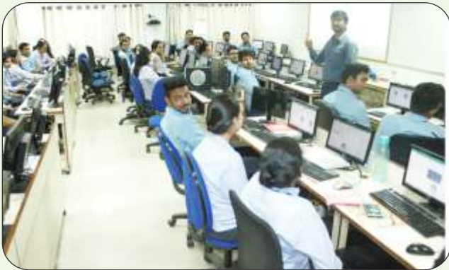
Adv. Excel Training Programme