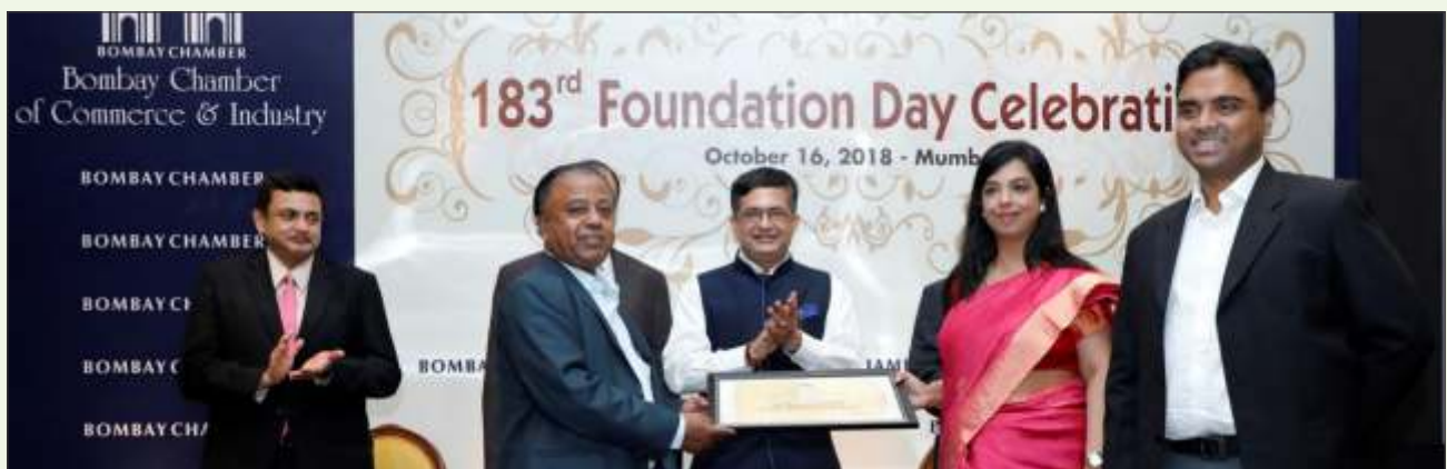
BCCI office safety award was awarded on 16th October 2108 to SFIMAR

In a country where Education is highly valued, how do you distinguish yourself as the Institute of choice? This is a question asked by many B-schools when it comes to taking their Institute to the next level. Mediocrity is the enemy of being good, and being good an enemy of achieving excellence. While some of their contemporaries who established B-schools entered the fray of being the best B-school at the word 'go', St. Francis Institute of Management & Research (SFIMAR) took more of a marathon approach. No point in running out of breath after the first lap. This approach paid rich dividends in the form of prestigious awards in one year.