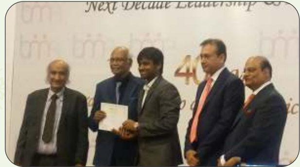
BMA Best Student Award