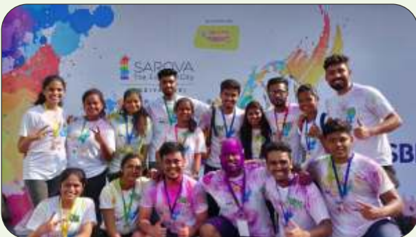
Radio Mirchi Fun Run