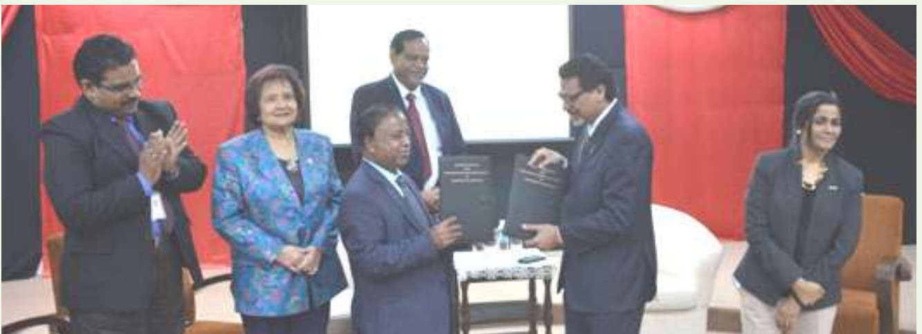
BINARY UNIVERSITY MALAYSIA

MOU was made between SFIMAR and Binary University on 24th November 2017 with an objective to understand, promote international understanding, development and friendship as well as to stimulate and support academic pursuits among students and faculty of two institutions in as much that the two institutions will engage mutually in students and faculty exchange programs, collaborative research projects, involve in exchange of publications, short term training programs, workshop, seminars and conferences. This MOU is still active stimulating academic vibrancy in both institutions