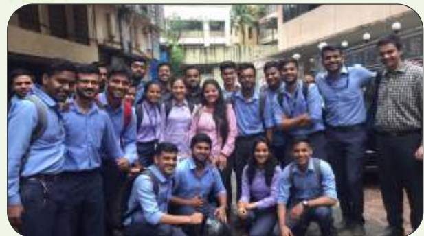
Team for URI