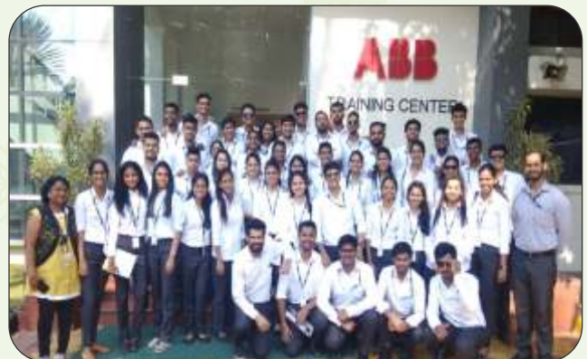
MMS Domestic Industrial Visit - Nashik & Igatpuri -2018