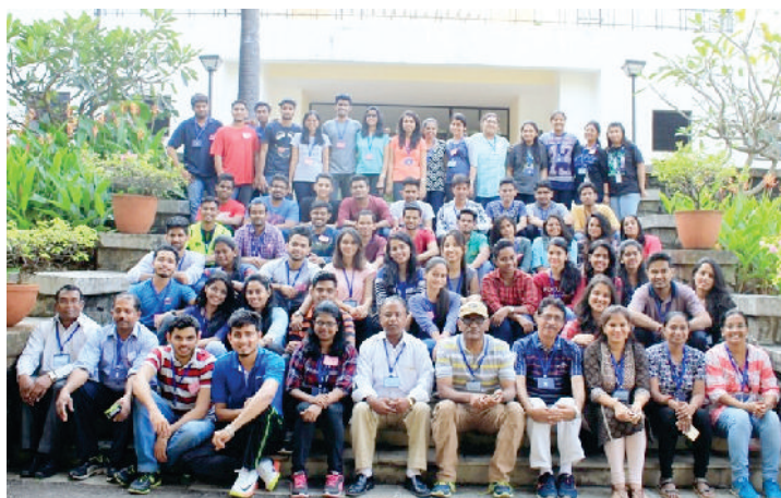
Group Photo - Outbound Training 2017 conducted for MMS & PGDM Students

Outbound Training is a training method for enhancing Student's performance through experiential learning. Outbound Training at SFIMAR revolves around activities designed to improve leadership, communication skills, planning, change management, delegation, teamwork, and motivation. Participants are divided into teams and assigned tasks or activities for completion in a specified time.