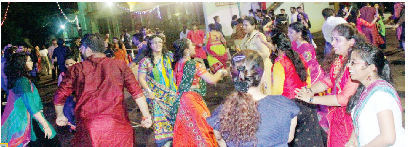
Dandiya Nite 2017