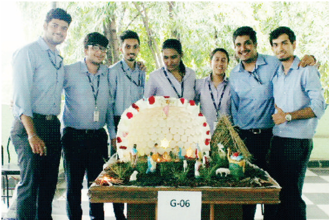
X'Mas Crib Making Competition organized by Malay - The Fine Arts Club