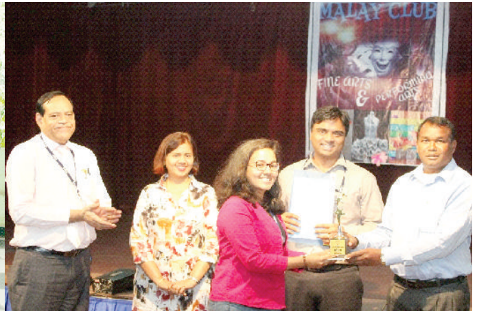
Star Performer Contest organized by Malay - The Fine Arts Club