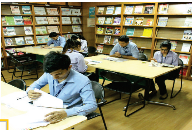
Students in the Reading Hall - LIRC