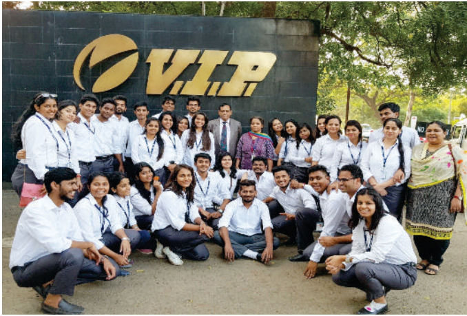
Visit to V.I.P