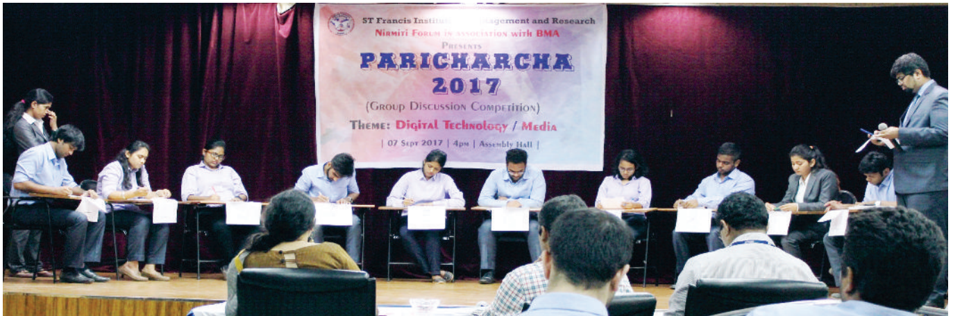
PARICHARCHA - GD Competition was organized by Nirmiti Forum in association with BMA, Mumbai