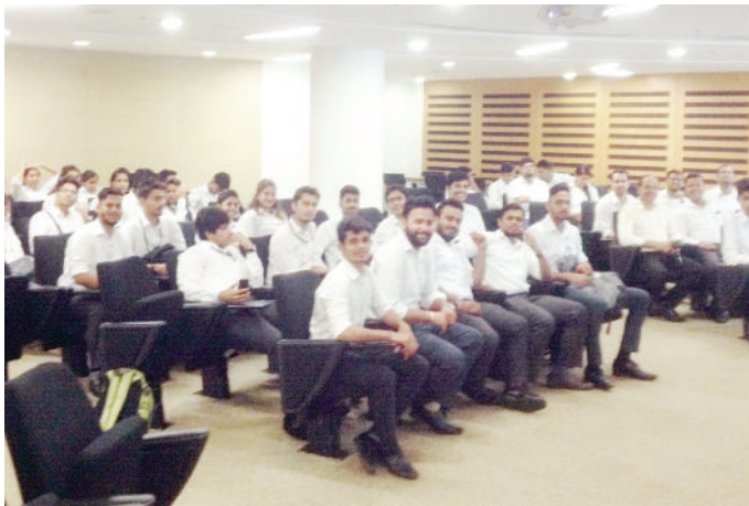
Visit to Godrej Industries