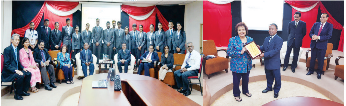
SFIMAR Delegation at the Binary University MoU Signing Ceremony

International Study tour to Bangkok & Pattaya, Thailand was organized by SFIMAR for its students from 23 RD Nov 2017 to 28 TH Nov. 2017. This study tour is one of the many initiatives our Institute has undertaken, so that our students understand how global businesses operates and gain cross-cultural advantages in order to succeed in a diverse and interdependent world. Through academic, social activities and cultural visits, it broadens their horizons and global cultural awareness.