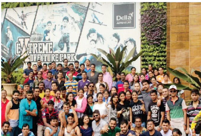
MFM/MMM Excursion to Lonavala