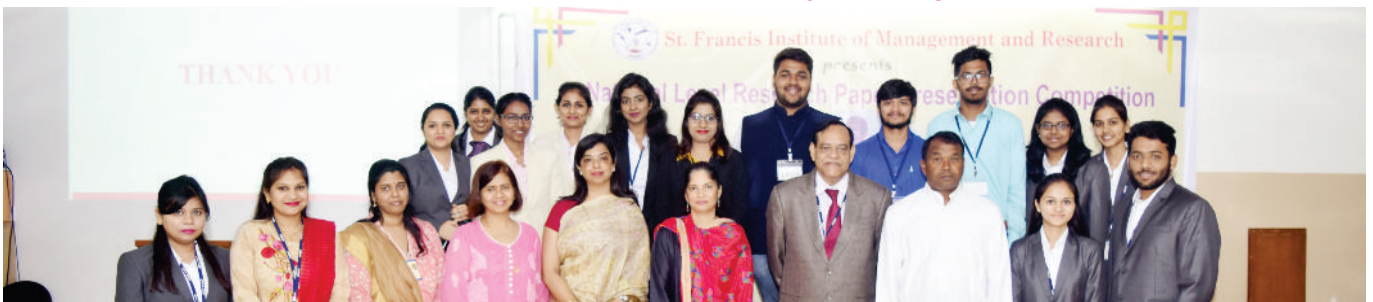
Group Photo - Anveshi 2018