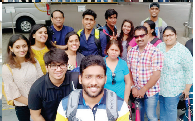
Fun Moments at Malaysia and Singapore