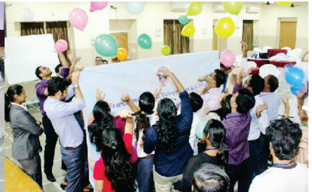
Participants enjoying the Workshop