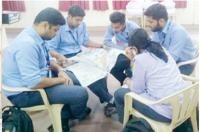
Business Model Workshop organized for students by Prerna Club