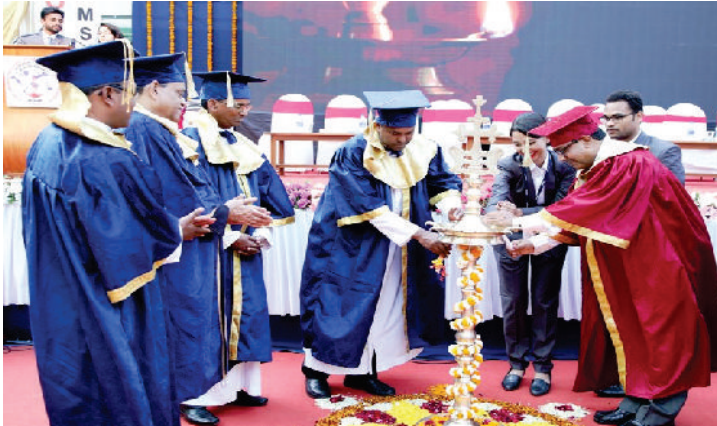
Lighting of the Lamp Ceremony