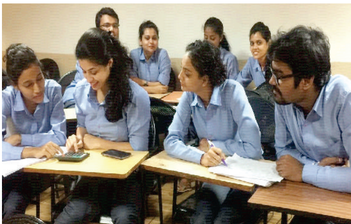
Students working on accounting practicals

SFIMAR encourages Peer-to-Peer Tutoring style that involves students teaching other students, A peer tutor boosts the classroom learning by stating examples that relate to other peer students; Having a tutor who is on same age level as them also helps to bridge the learning gaps.