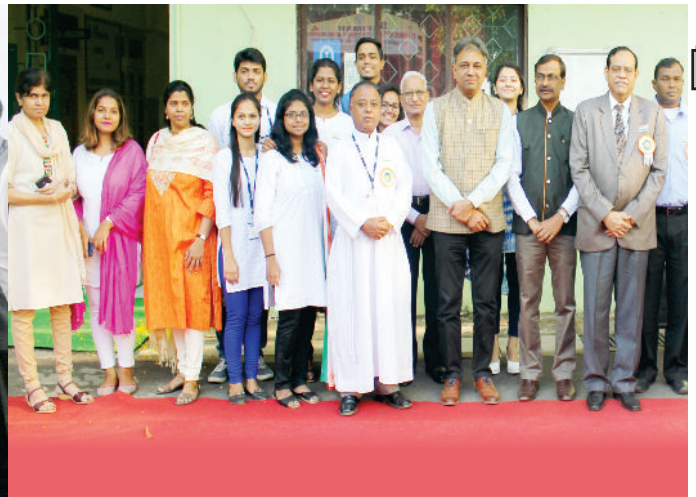
Republic Day Celebrations