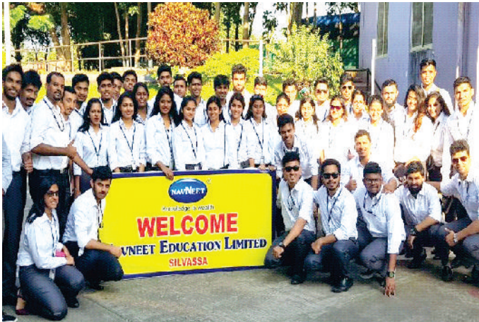
Visit to Navneet Books