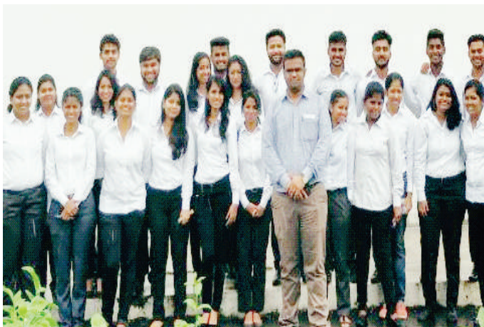
Visit to IPCA Labs - HR Students