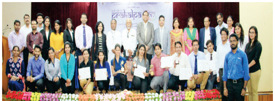
Group Photo - Prakalpa 2017

P rakalpa was conceptualized by St. Francis Institute of Management & Research and it's first ever- edition was conducted at the intra-collegiate level in November 2015. The following year it was held at an inter-collegiate level and it proved to be a great success. Building on this earlier success, this year Prakalpa was held on the 19 th of November, 2017.