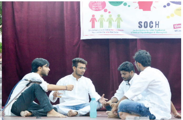
SKIT Competition - SOCH Workshop