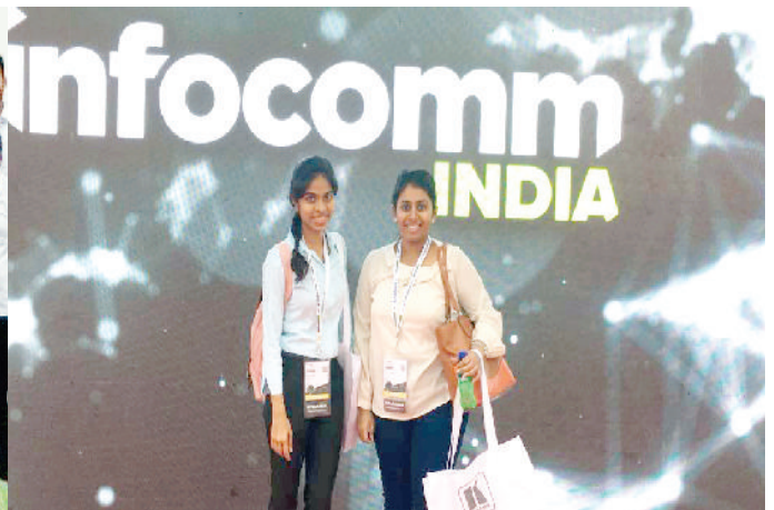
Visit to Infocomm India Summit 2017