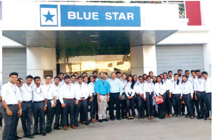
Visit to Blue Star