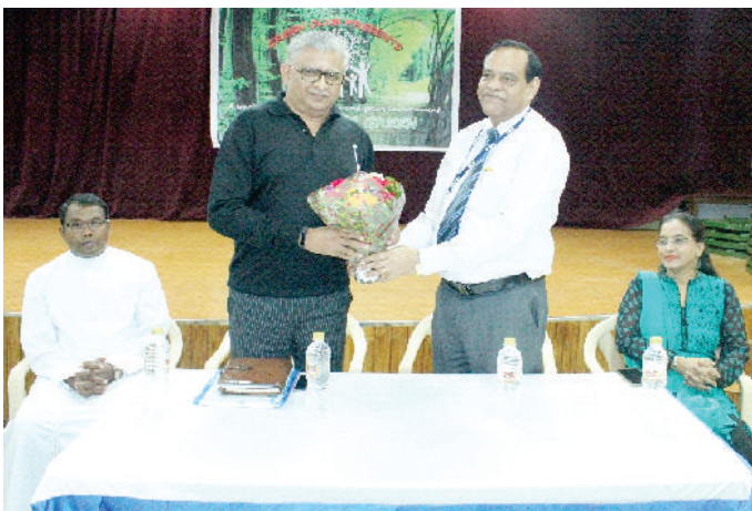
Seminar on Nursery Management organized by Green Club of SFIMAR