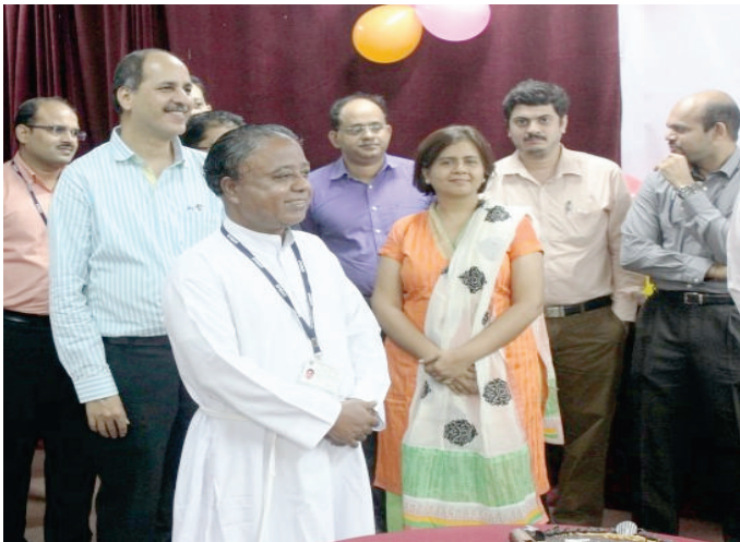
Teacher's Day Celebrations