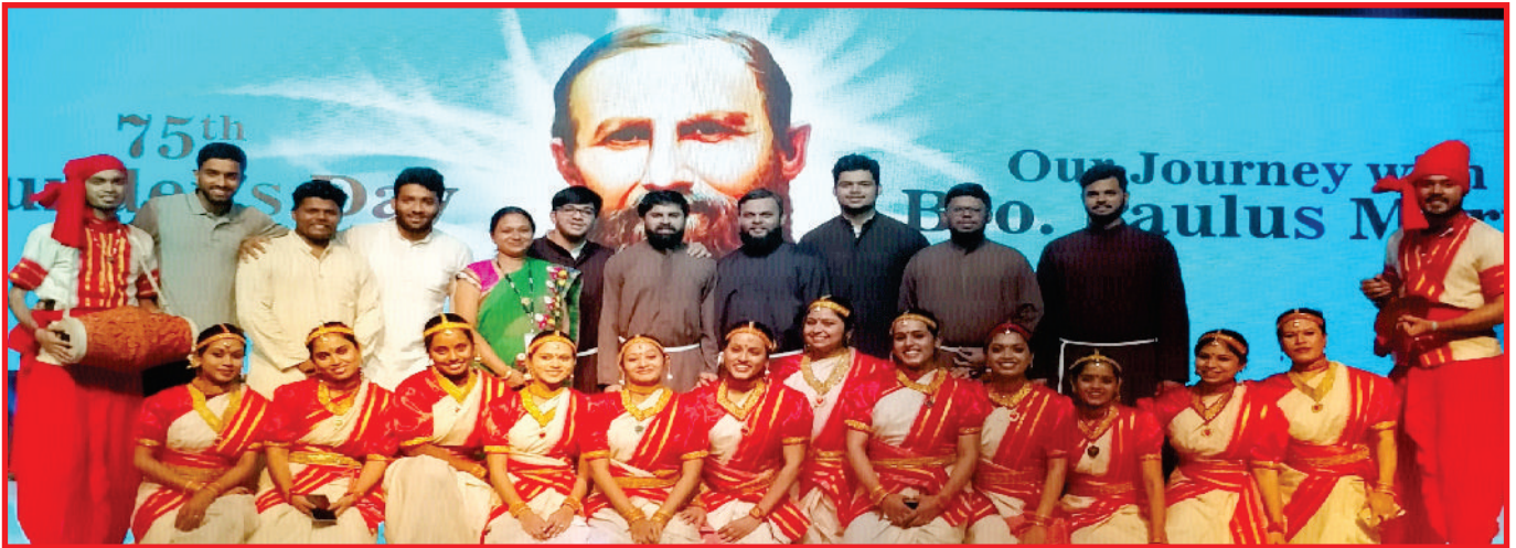
SFIMAR Students performing at Synergy 2017