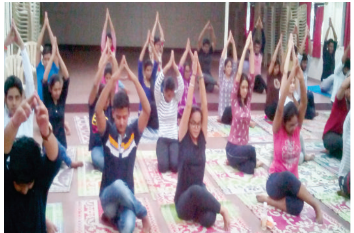
Yoga session for students