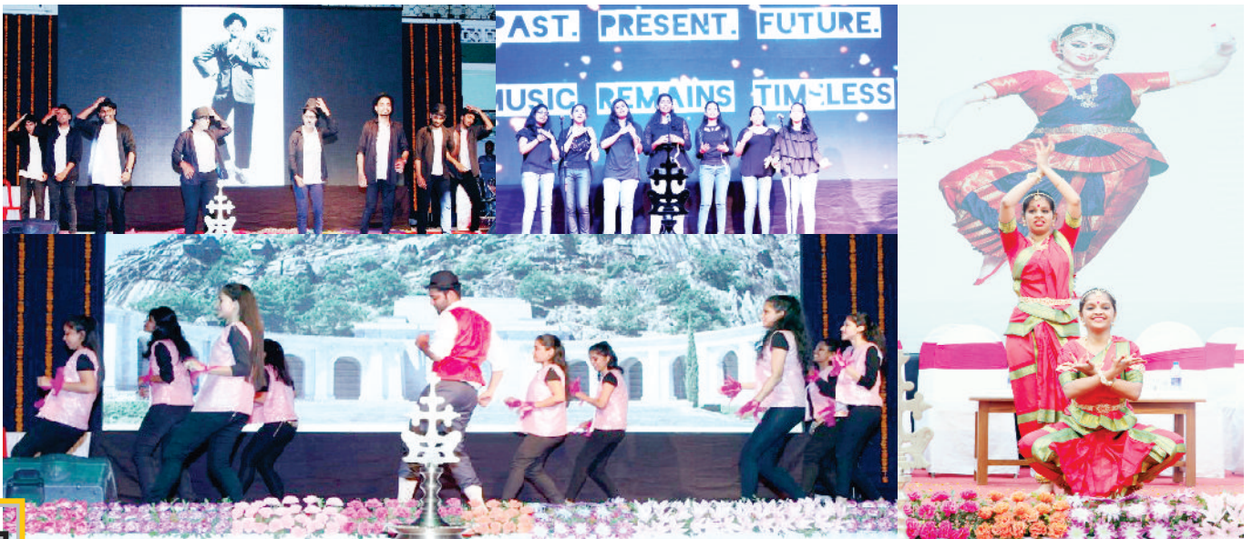
Student's performing during Luminance 2018

Luminance is a platform of recognizing, appreciating and rewarding the efforts of all our students who sincerely organized and coordinated various student activities throughout the year in and around campus. It is also a platform to appreciate the best students in academic and non-academic domain. The Theme for the Event was Time Machine. The event was successfully held at SFIMAR Campus on 10 th Mar. 2018