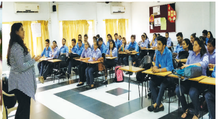
Workshop on Effective Communication Skills