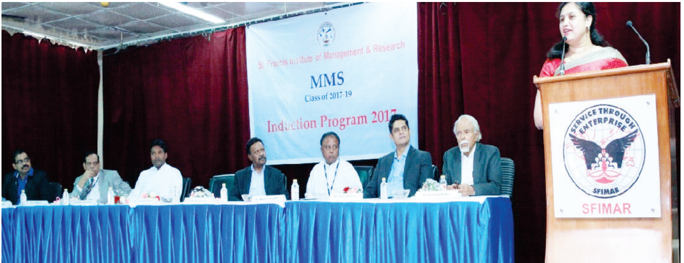
Dignitaries present for the MMS Induction Programme