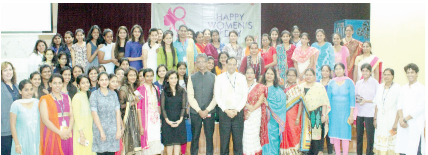
International Women's Day Celebrations