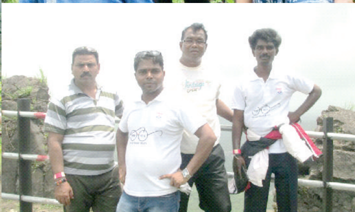
Faculty & Staff Members enjoying the Trek at Natventure Camp, Wada