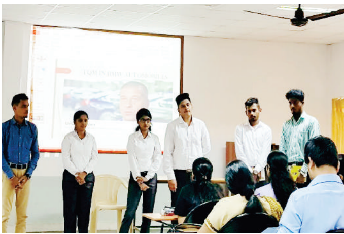
Class Presentation by SFIMAR Students