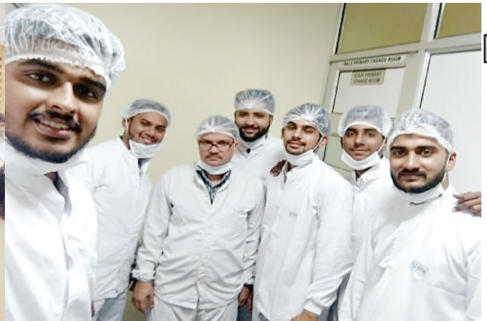
Visit to IPCA Labs - Operations Student