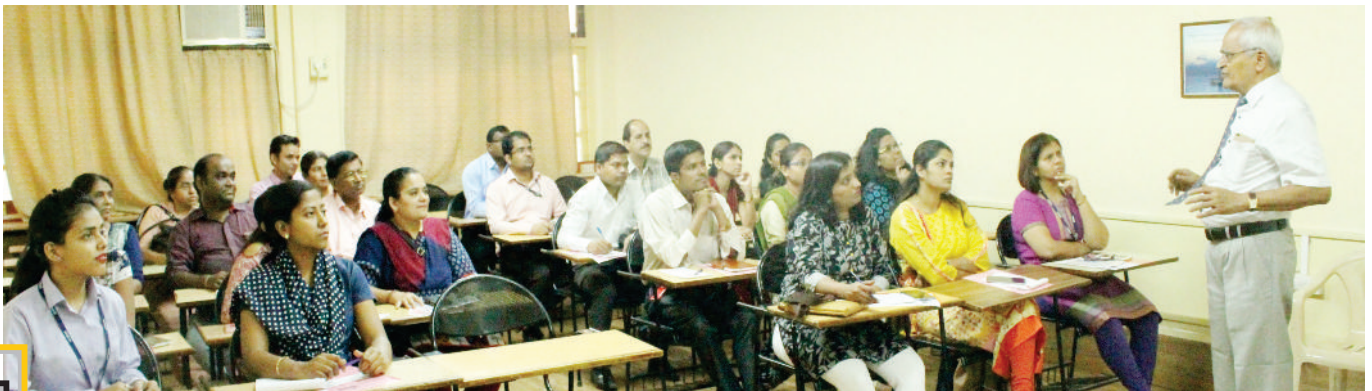
Corporate Training on GST E-Way Bill for Technosoft Pvt. Ltd.