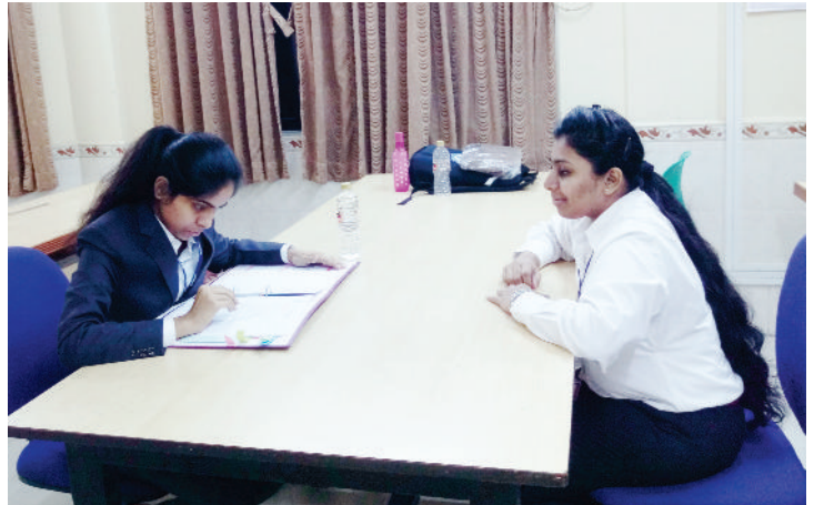
Role Play conducted for MMS II - IT Students on IT Audit

Role plays allow students to immediately apply content as they are put in the role of a decision maker who must make a decision regarding a policy, resource allocation, or some other outcome. This technique is an excellent tool for engaging students and allowing them to interact with their peers as they try to complete the task assigned to them in their specific role.