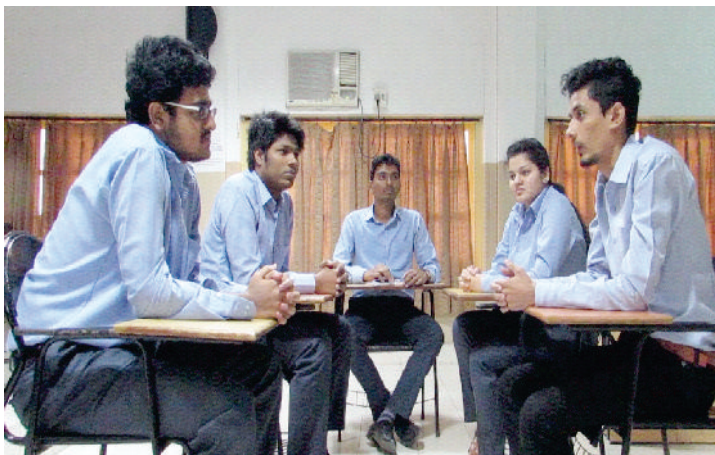
Group Discussion on latest Trends in Business

The idea of 'Thought Leadership' programme introduced by the Institute is to enhance the student's knowledge of current thought-provoking topics, ideas generation and their deliberation on the subject matter, communication skills. The programme underlines directional guidance to the students to prepare them for answering questions in placement interviews on recent topics and trends in their area of their specialization.