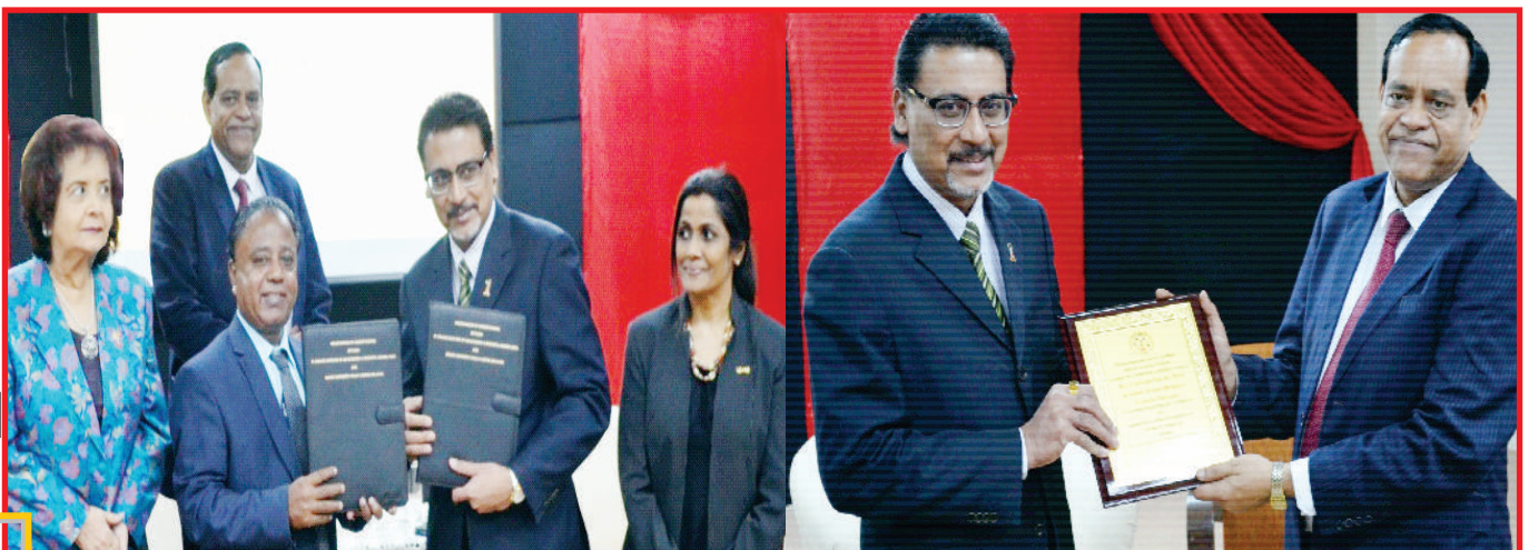
Academic Tie-Up between SFIMAR & Bina University, Malaysia for Research & Entrepreneurship Development.