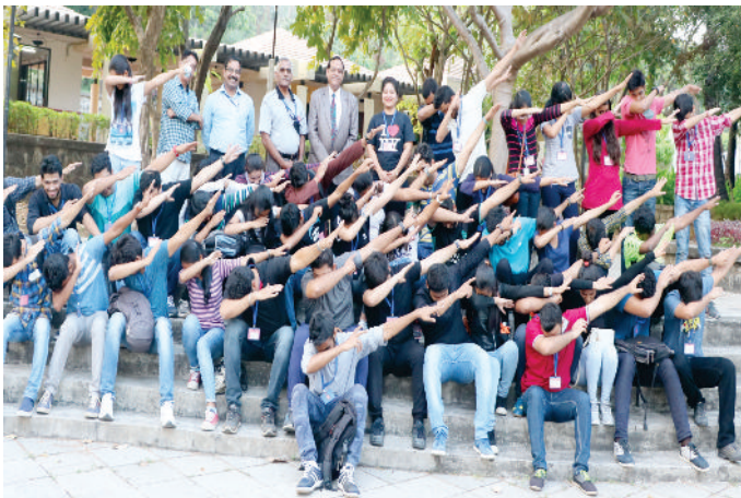
Students enjoying the Outbound Training Session