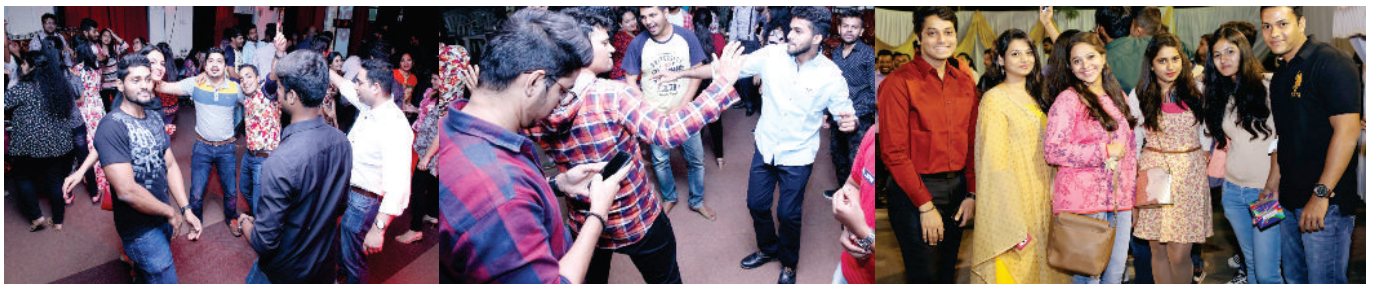
SFIMAR Alumni dancing to the beats of DJ