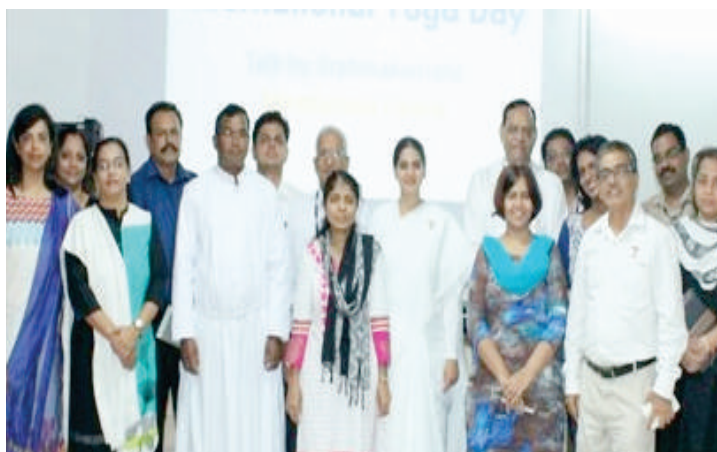
Talk on Raj Yoga by Brahmakumaris on International Yoga Day

SFIMAR ensures that its students are fit enough to fight the challenges they face. Students are provided enough opportunities to build on their physical fitness and embark on the healthier path. Aerobics, Yoga & Meditation are also dedicatedly followed in campus. Also Stress Managements sessions by the Brahmakumaris are conducted regularly at SFIMAR.