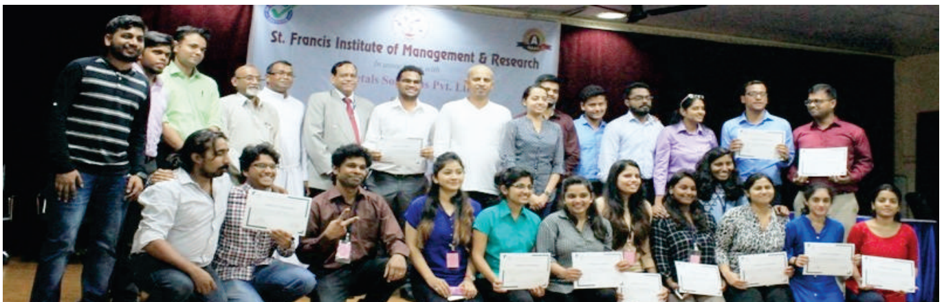
Group Photo - Participants & Trainers