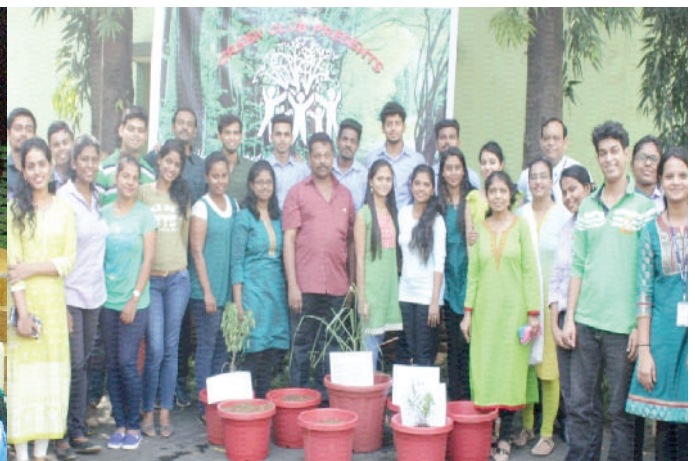
Campus-wide Tree Plantation undertaken by Green Club Volunteers