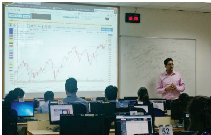
Trading Session conducted for Students

A two day training certification programme was organised for MMS I and PGDM I students. The key takeaway from the workshop was to understand that "Higher the profit, Higher the risk." The session also thought to play safe in the market while investing. Mandate NISM certifications , Basic NISM modules were covered apart from the Trading session.