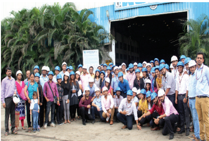
Visit to Bhushan Steel, MFM/MMM Students