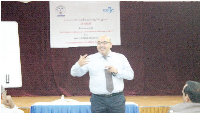
Corporate On Boarding Session

The Career Management Centre (CMC) is the liaison between our highly diverse talent pool of students, alumni, faculty and employers. It constantly interacts with the corporate sector for inviting them for their on and off campus recruitment and assist them in handling the entire placement process for students CMC takes keen interest in the overall personality development of students and enhancing their employability prospects by providing various one-to-one services to groom students and make them ready for the CorporateWorld.