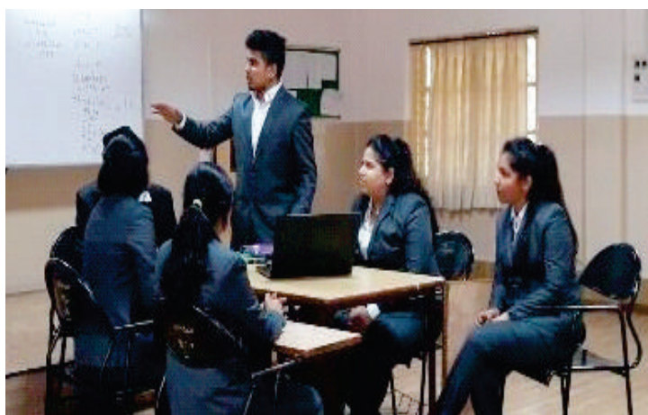
Presentation on Board Room Discussion

The 'Lead by Example' programme picks up small cohorts of students in various niche areas, based on their aptitude and attitude. These students are provided specialized advanced training in those niche areas to excel and lead other students. Faculty members and CMC Dept. are extensively involved in conducting mock interviews and group discussions for all the students. Corporate recruiters have been brought in to train the students in these two aspects.