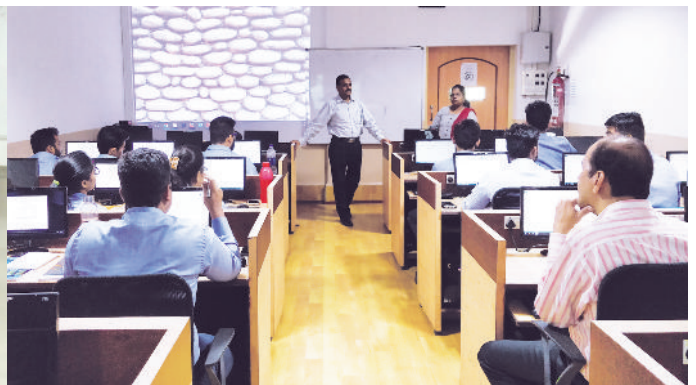
Project Management Training for Students