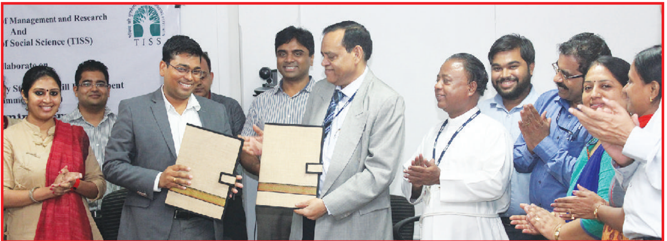
Academic Tie-Up between SFIMAR & TISS for Youth Skill Development Programme