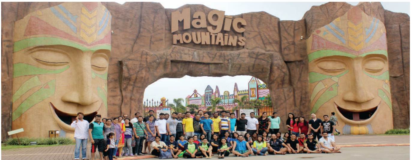
MFM/MMM Students enjoying at Magic Mountains, Lonavala