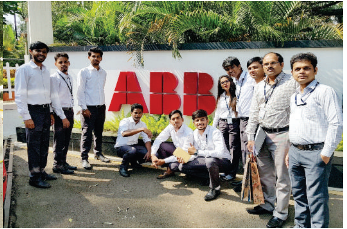
Visit to A.B.B Industries