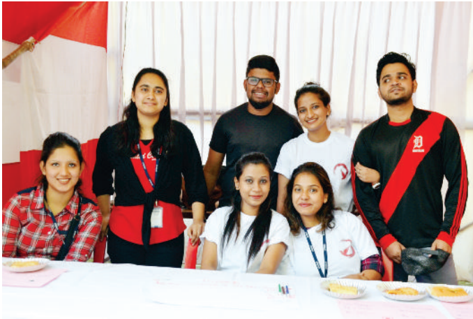
Food Stall managed by Prerna Club during Exuberance 2018