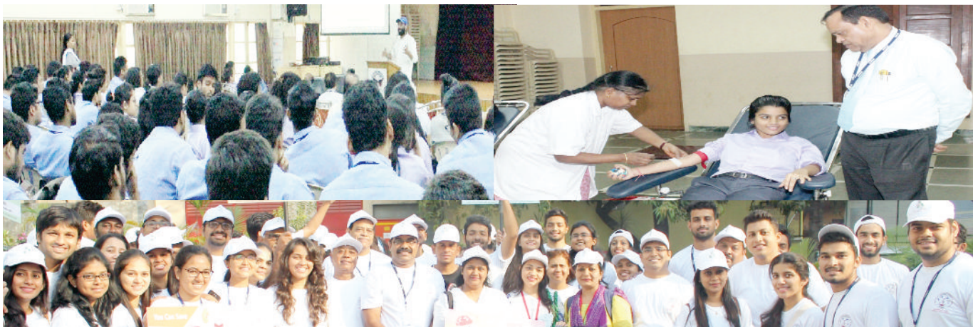
Abhimaan Club organizes all the activities w.r.t Institute Social Responsibility (ISR)