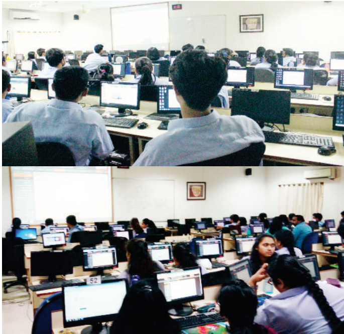
LAB sessions are conducted on various S/W

SFIMAR continuously contributes to technological & infrastructural development of the Institute by upgrading and adding various new facilities for administrative streamlining.