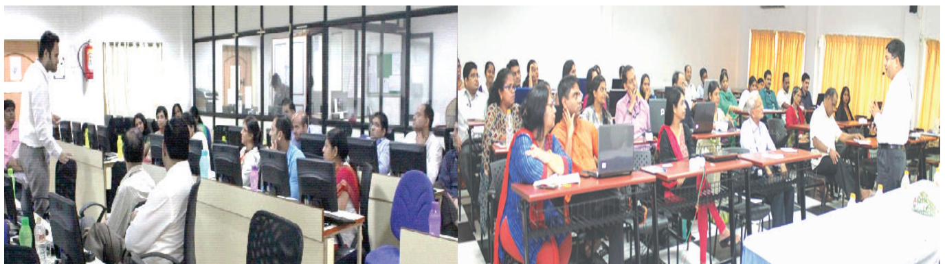
Interactive Session between the Trainer & Participants

“Research is to see what everybody else has seen, and to think what nobody else has thought”