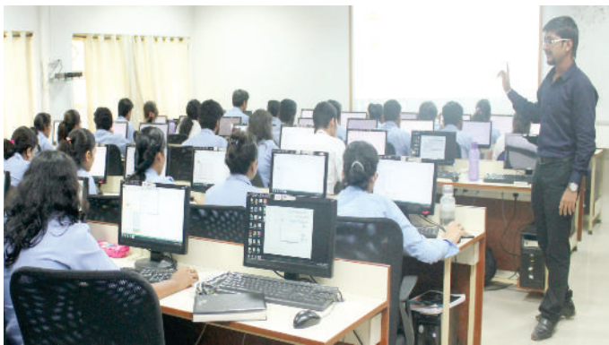
Adv. Excel Training conducted for Students