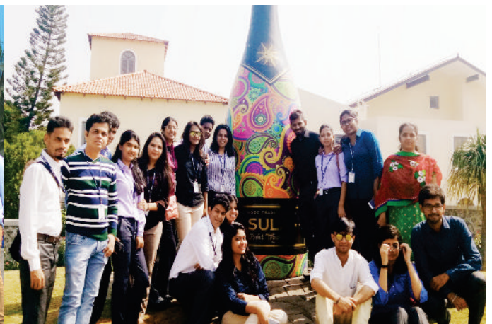
Visit to Sula Vineyards