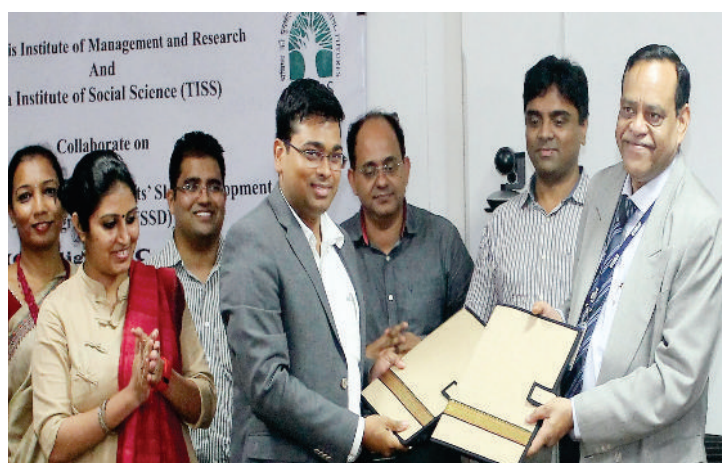
MoU Signing Ceremony between SFIMAR & TISS