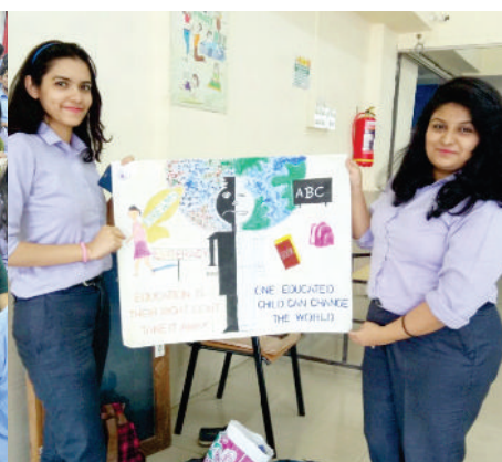
SFIMAR Students winning the 1 st Runner Up Prize for Poster Making Competition at UDAAN 2018