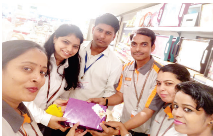
Students working on Live Project at Big Bazaar