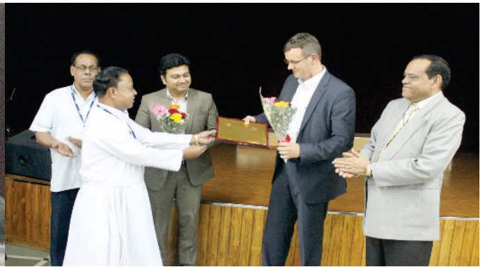
Session on Cross Cultural Issues