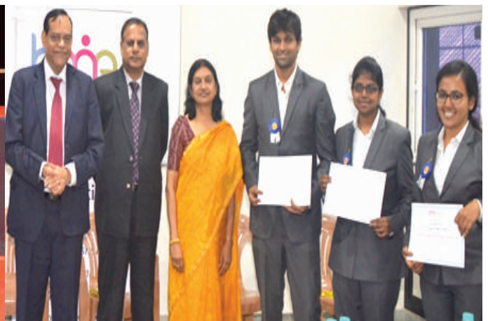
Runner - Up Dandekar Trophy 2018