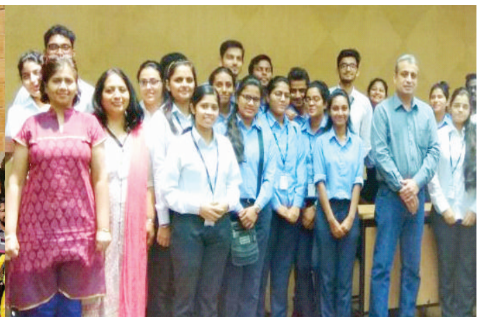
Visit to National Stock Exchange