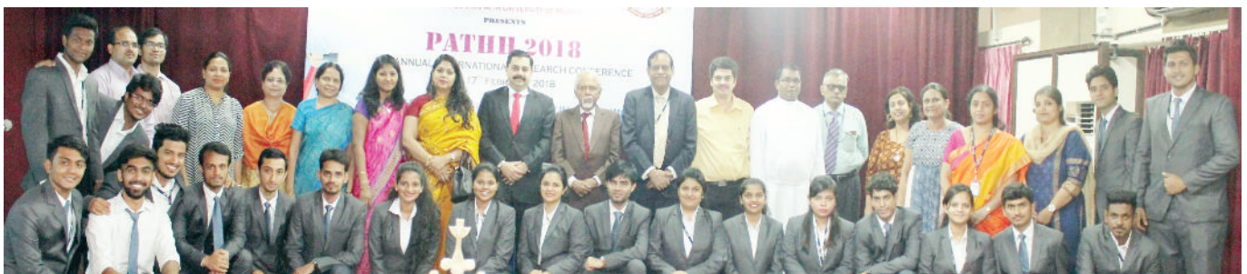
Group Photo - Pathh 2018

In order to give due recognition to the inquisitiveness and creativity of Academicians, Research Scholars & students, SFIMAR organized Pathh - International Research Conference on 17 th Feb. 2018. This endeavour was taken to provide a platform to the potential researchers and academic scholars to demonstrate and hone their skills. The Theme for Research Conference was “Agile Management Practices in VUCA World.”