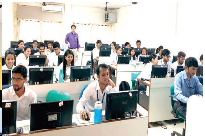
Excel Training for Students