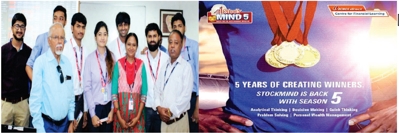
Mock Stock & Stock Mind Games organized by Finatics Forum