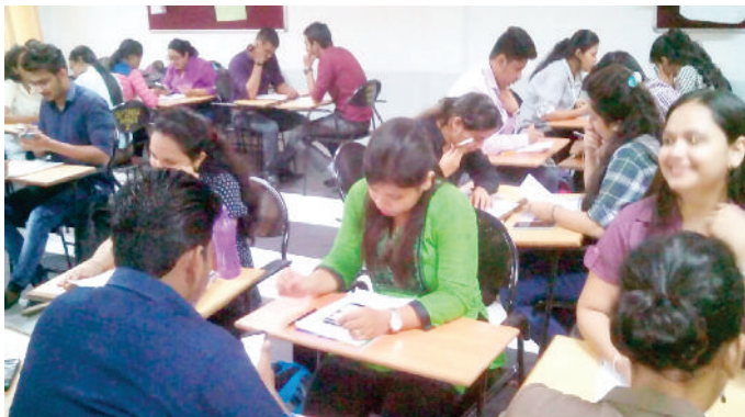
Workshop on Business News Analysis