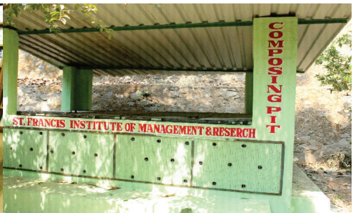
Composting Pit hosted in SFIMAR for VermiCulture