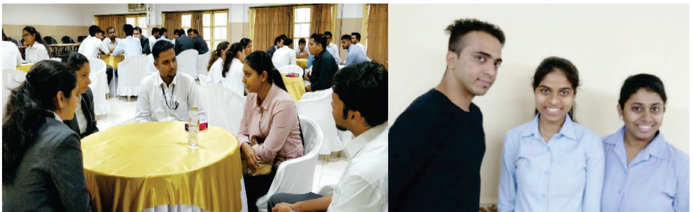
SFIMAR Alumni grooming the Final Year Students

Alumni Connect was organized on 7 th Oct. 2017 with an objective of increasing interaction and networking between SFIMAR Alumni & Final year MMS & PGDM students. It aimed at hosting grooming sessions executed by our Alumni for the Final year Students to face corporate challenges. The alumni also shared their experiences, ideas, thoughts and expertise for helping students launch themselves in the corporate world.