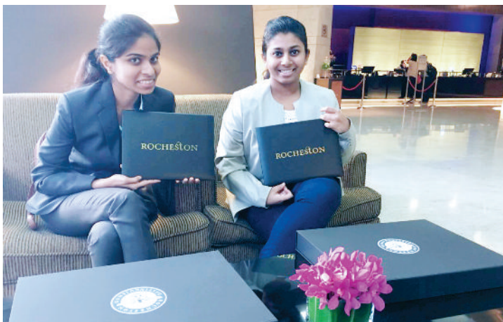
MMS II - IT Students attended Workshop on IoT, Big Data & Innovation organized by Rochester at Hyatt Regency in Nov. 2017