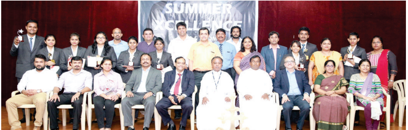
Group Photo - Summer Excellence 2017

S UMMER XCELLENCE -2017 was held on 19 th August, 2017. Out of the preliminary 180 presentations, 24 presentations from various specializations of MMS & PGDM were selected by the panel of judges comprising of SFIMAR faculty members. All 24 projects were divided into 4 panels i.e. 1. Finance 2. Marketing 3. HR 4. IT & Ops, These were evaluated by judges from various industries. The Winners for Summer Xcellence-2017 were declared by the corporate judges for each specialization.