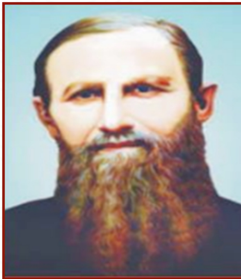
BRO. PAULUS MORITZ FOUNDER - CMSF (JUNE 29, 1869 - NOVEMBER 19, 1942)