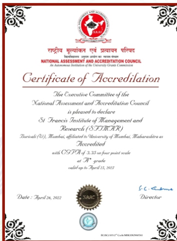
A+ GRADE CERTIFICATE BY NAAC