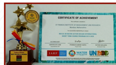
CERTIFICATE FROM RIO+ 25 UN