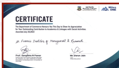
UNIVERSITY OF MUMBAI CERTIFICATE FOR OUTSTANDING CONTRIBUTION TO ACADEMICS