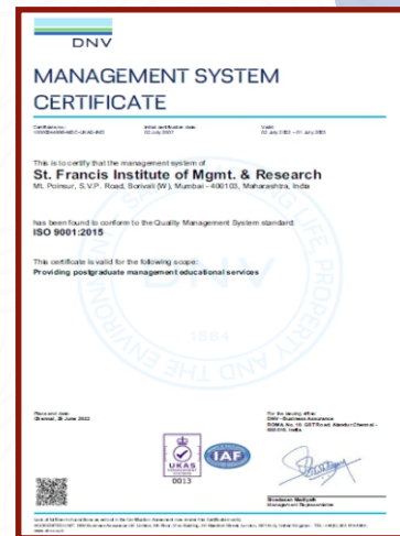
ISO 9001:2015 CERTIFICATE